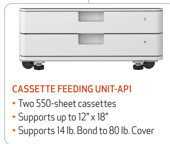
CASSETTE FEEDING UNIT-API