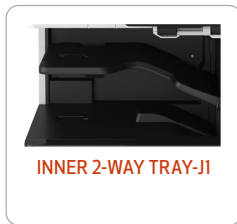
INNER 2-WAY TRAY-J1